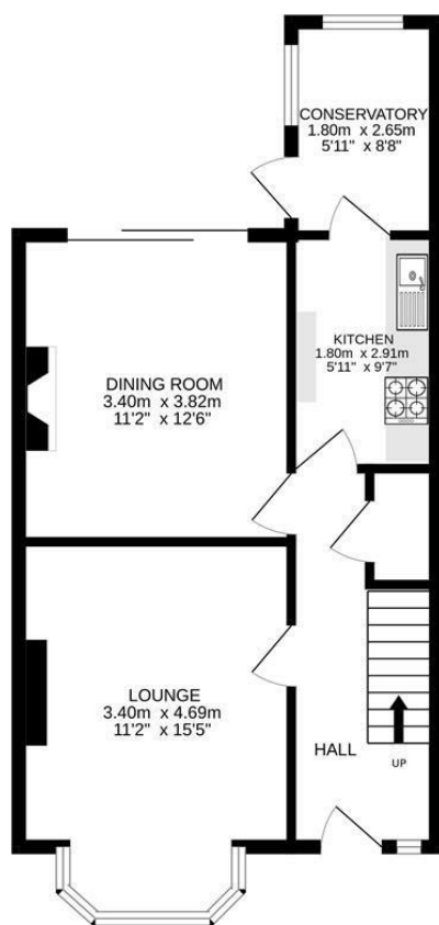
Ground floor 45.4 sq.m. (489 sq.ft.) approx.