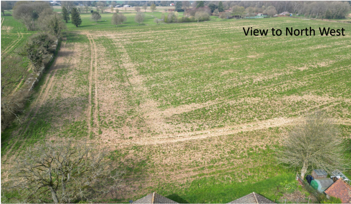
View to North West