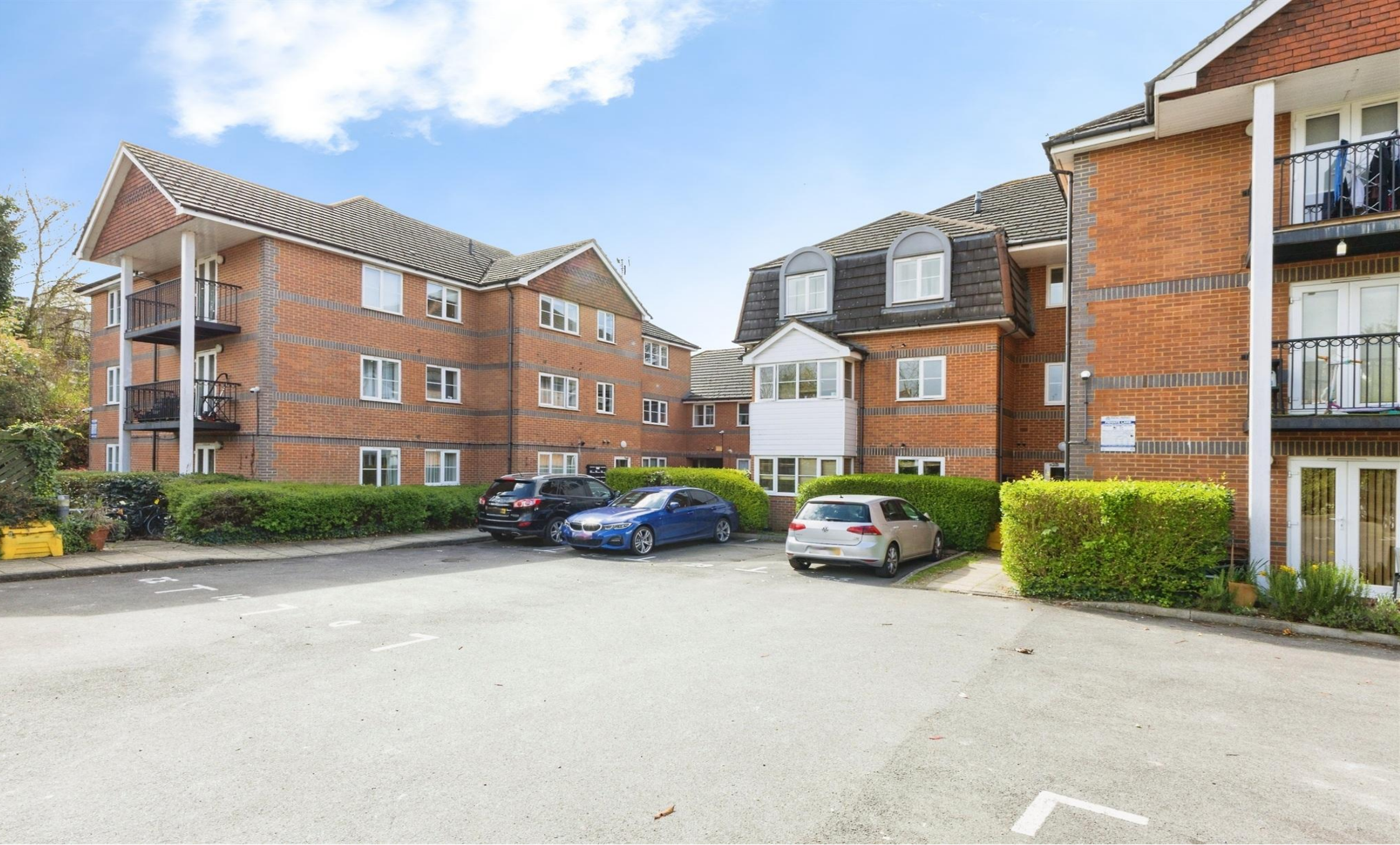
Farringdon Court, Erleigh Road Reading RG1 5NT