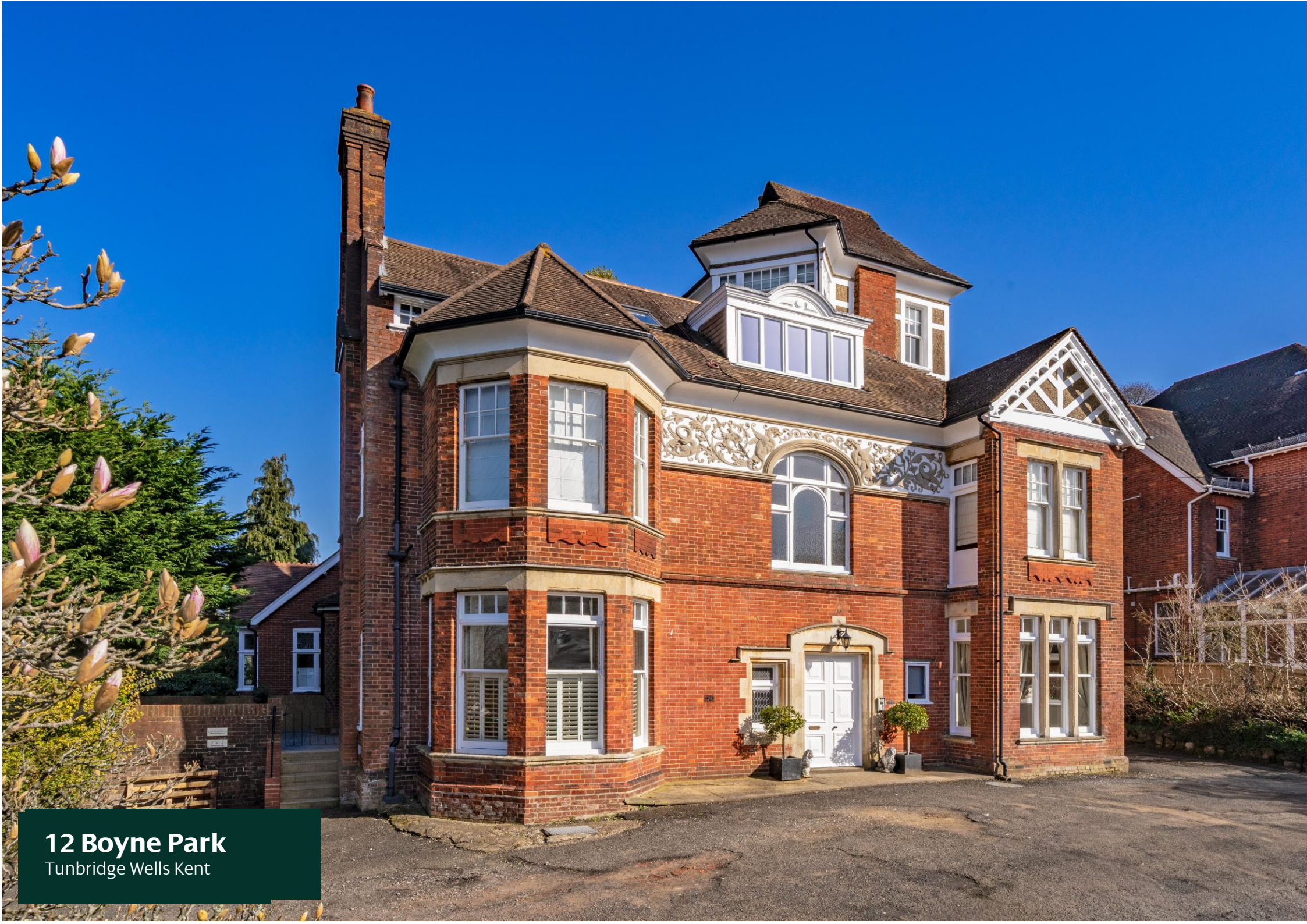
12 Boyne Park Tunbridge Wells Kent