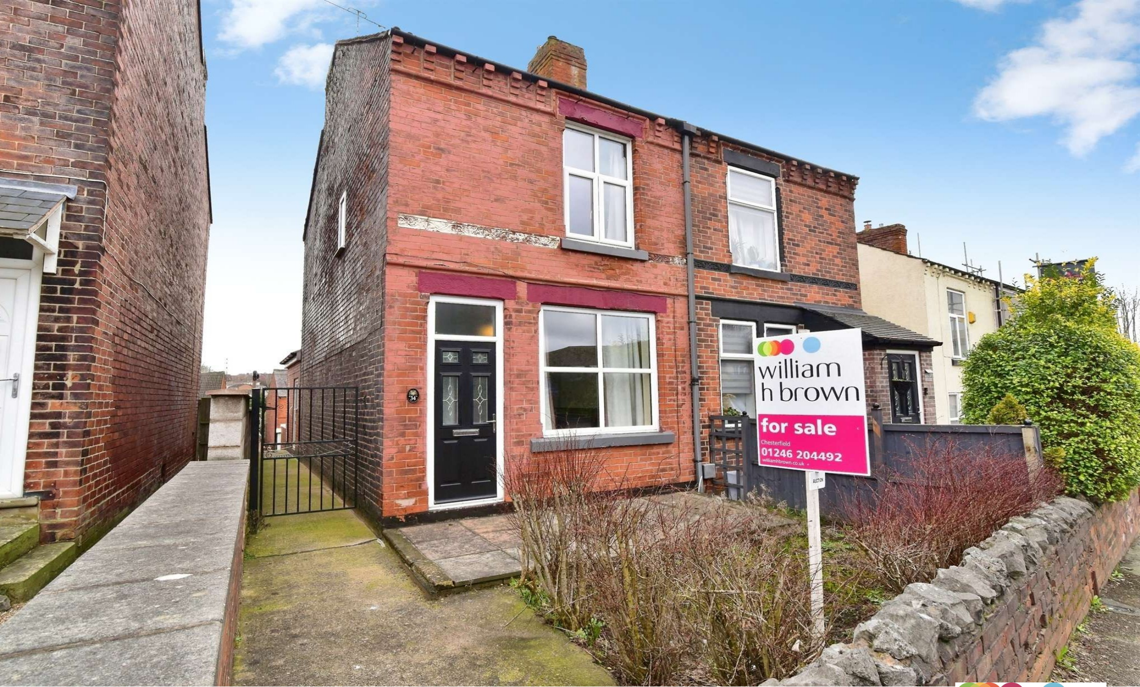
Jawbones Hill, CHESTERFIELD S40 2EN