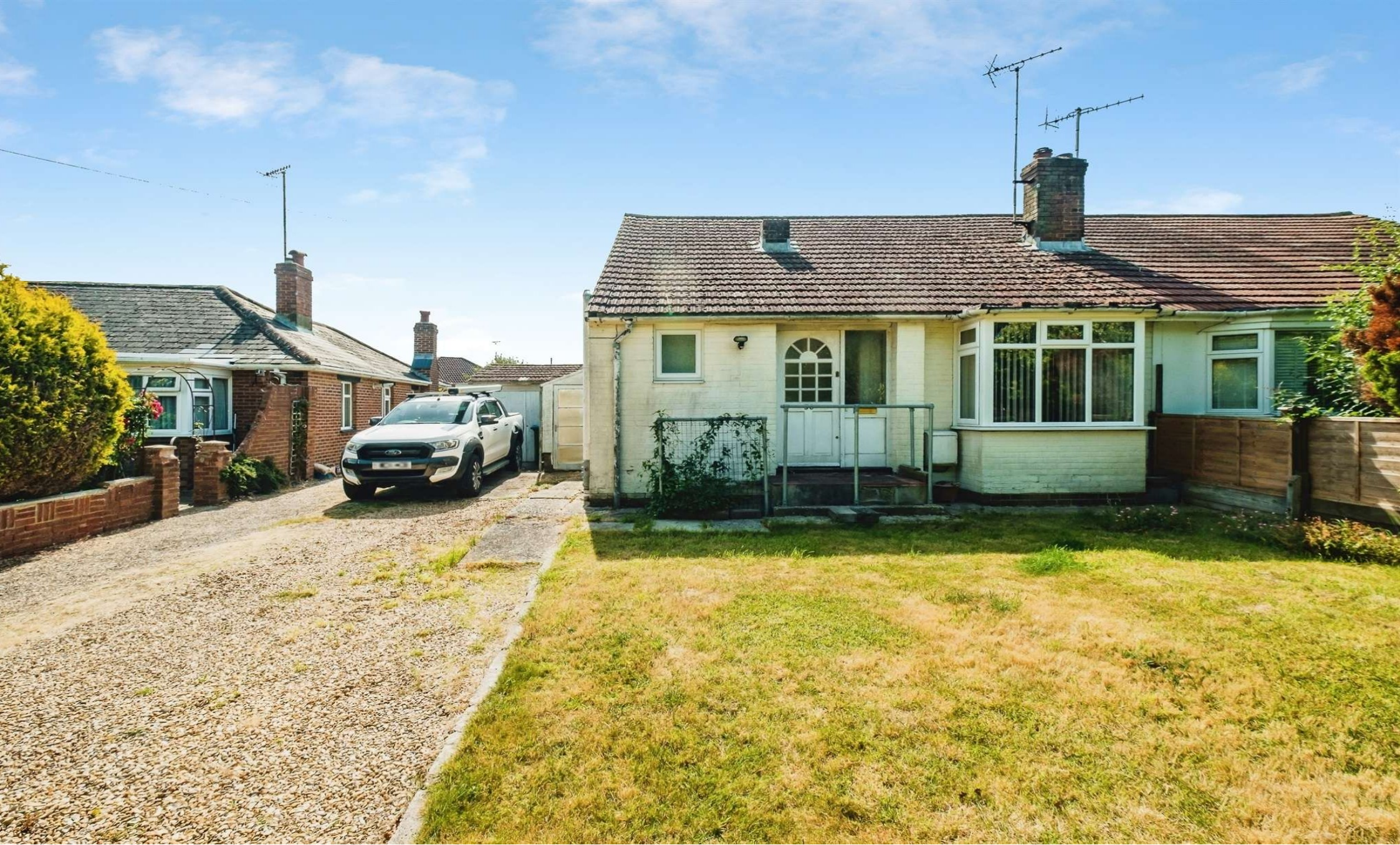
Mill Lane, Rustington Littlehampton BN16 3JN