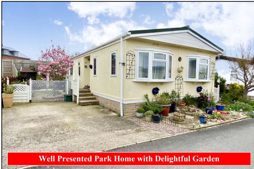
Well Presented Park Home with Delightful Garden

57 Oaklands Park, Crossways, Nr Dorchester, Dorset. DT2 8JQ