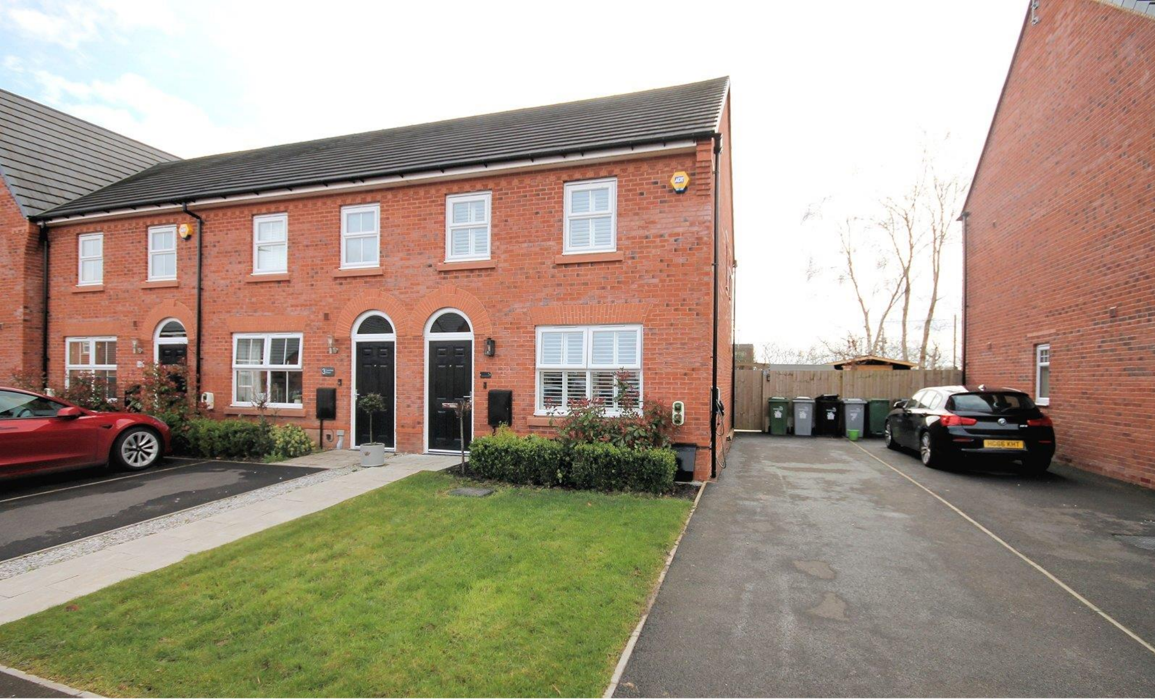
Chelford Townfield Place