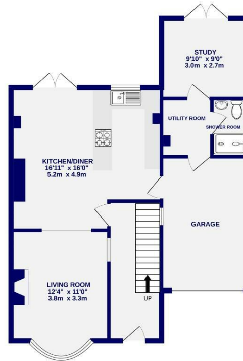
GROUND FLOOR 772 sq.ft. (71.8 sq.m.) approx.