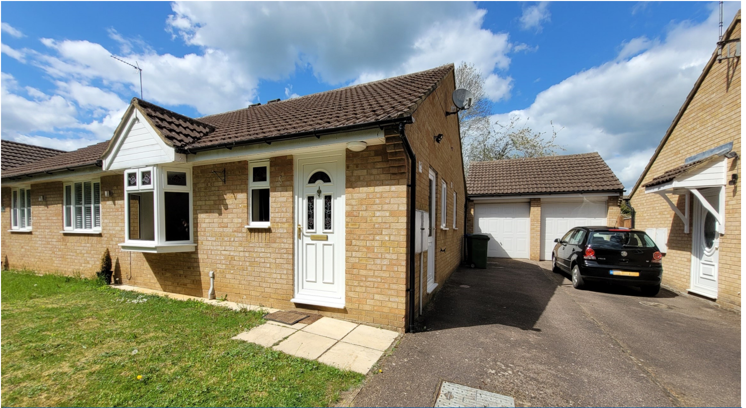
HORTON CLOSE, MIDDLETON CHENEY, OX17 2LQ

Telephone: 01295 275909 • Email: info@steppingstonesletting.com