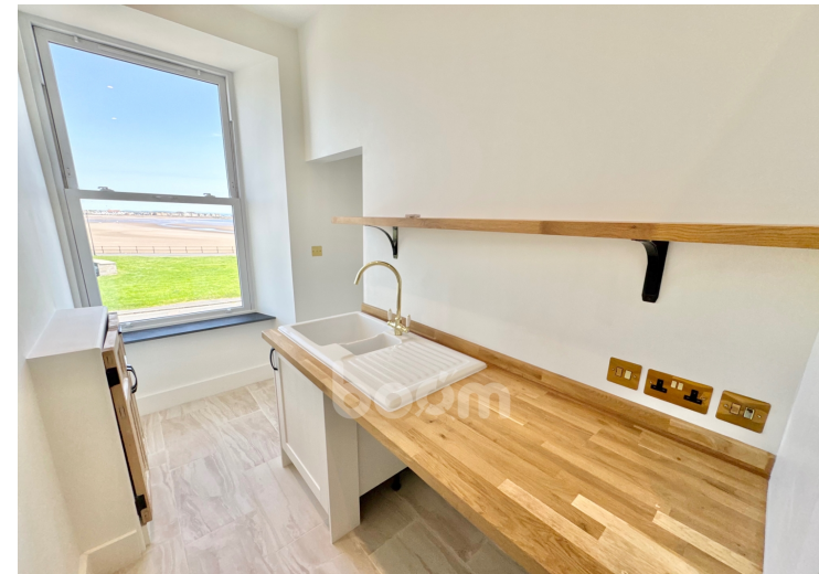
Arran Place, Ardrossan