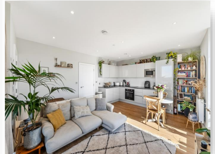
Millwards Court, Greyhound Parade, London SW17 0JQ