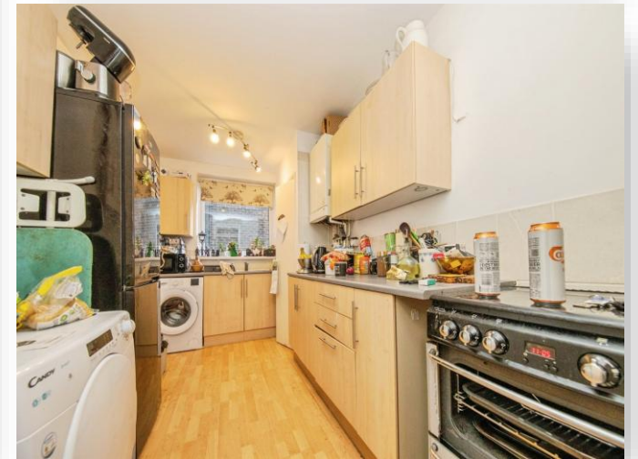
Cedar House, Heatherhayes, Ipswich, IP2 9DD