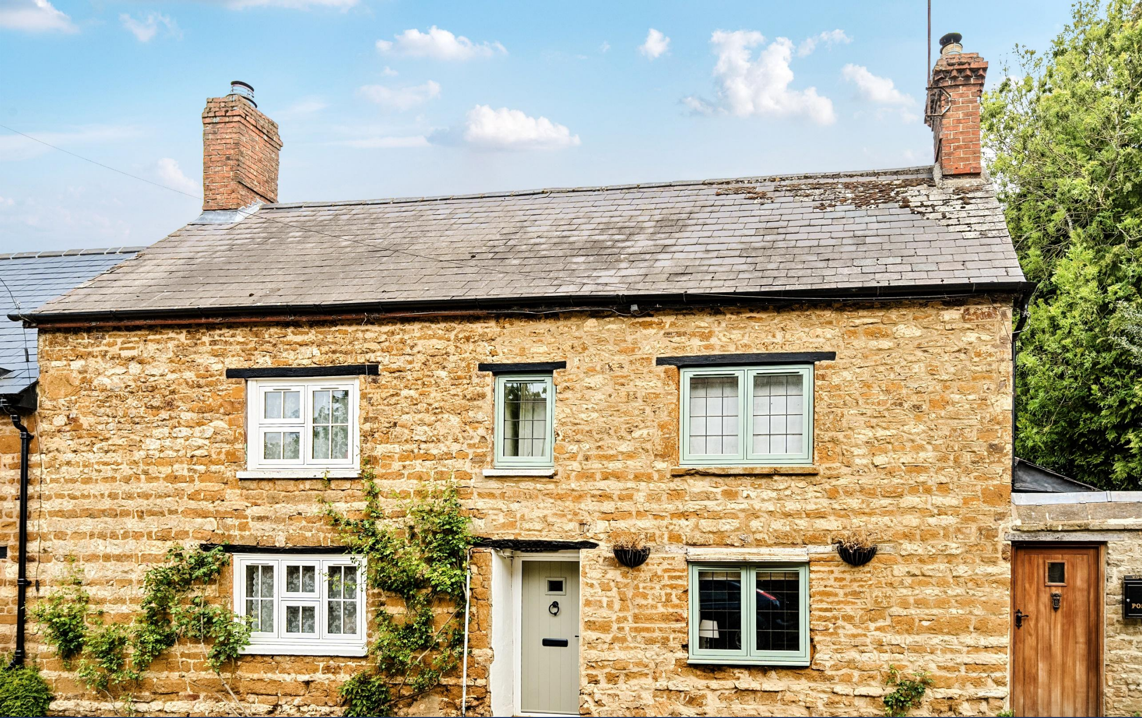
Herb Cottage, High Street, Culworth, Northamptonshire, OX17 2BD