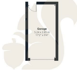
Ground Floor Building 3