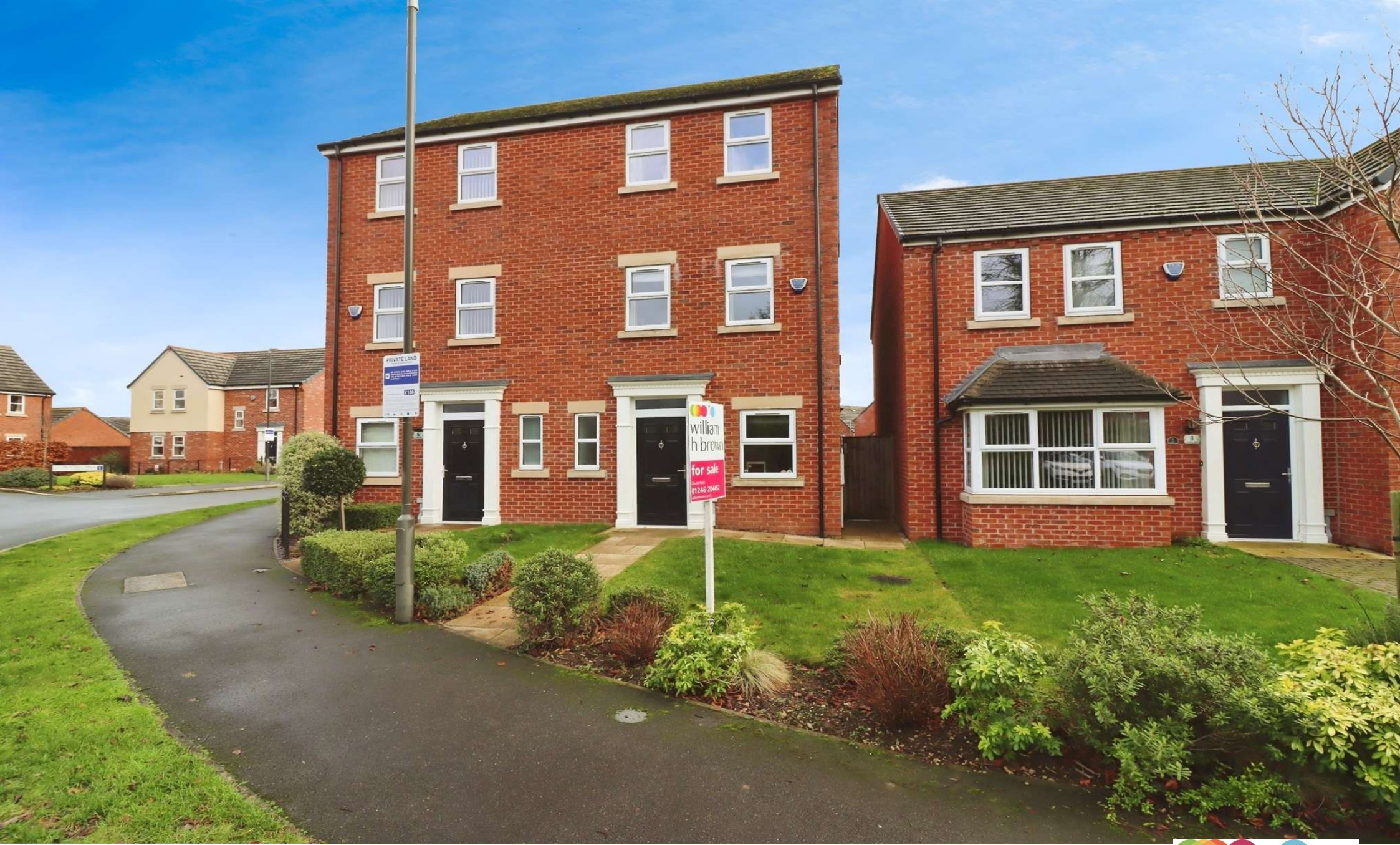
Hunters Walk, Chesterfield S40 1GB