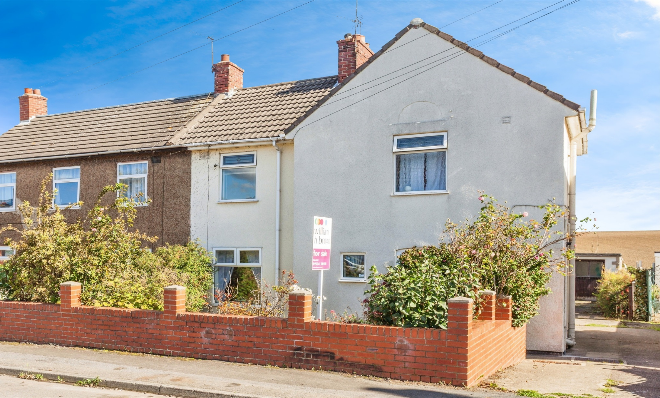
East Street, Havercroft Wakefield WF4 2HA