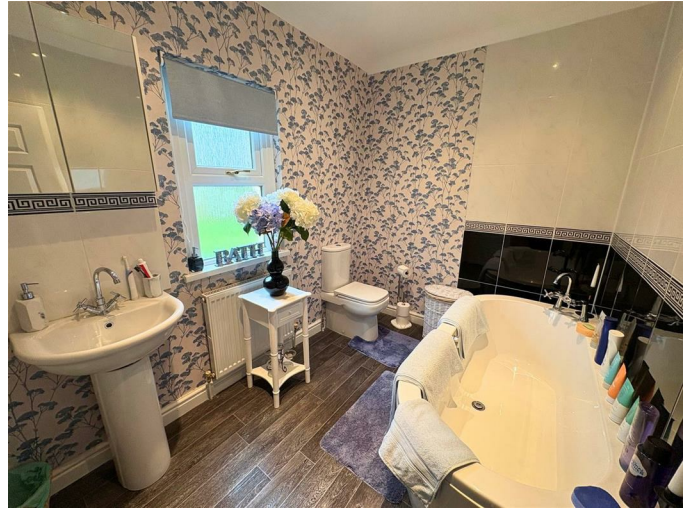
Bathroom 9'6" 6'7" (2.91 2.03)

Skimmed and coved ceiling with spotlights, papered and tiled walls, tile effect vinyl flooring, radiator, three piece suite comprising a wall mounted oval bath, pedestal wash hand basin and a low level W.C., storage cupboard via folding door, uPVC double glazed window with obscured glass to the side.