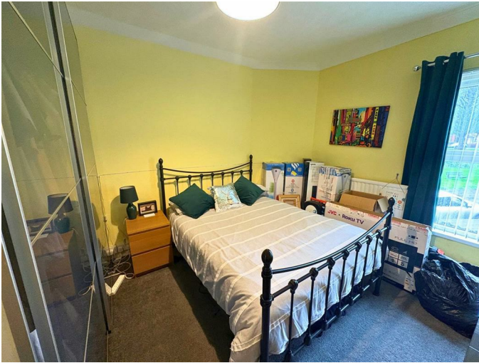
Bedroom Three 13'10" x 10'2" (4.23 x 3.12)

Textured and coved ceiling, skimmed walls, fitted carpet, radiator, fitted sliding door wardrobe, uPVC double glazed window to the rear.