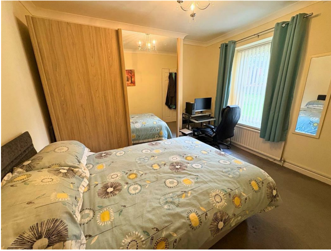
Bedroom Two 11'7" x 10'5" (3.54 x 3.20)

Skimmed and coved ceiling, skimmed walls, fitted carpet, radiator, uPVC double glazed window to the rear.