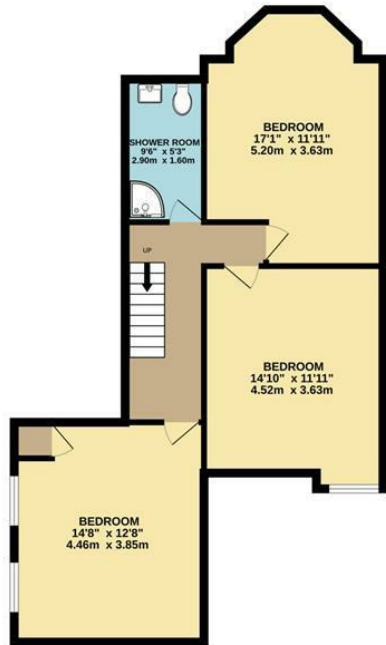
LOWER GROUND FLOOR 660 sq.ft. (61.3 sq.m.) approx.