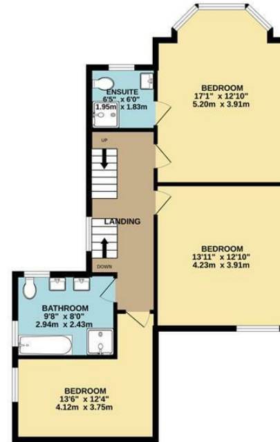
1ST FLOOR 723 sq.ft. (67.2 sq.m.) approx.