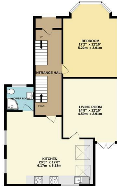
GROUND FLOOR 860 sq.ft. (79.9 sq.m.) approx.