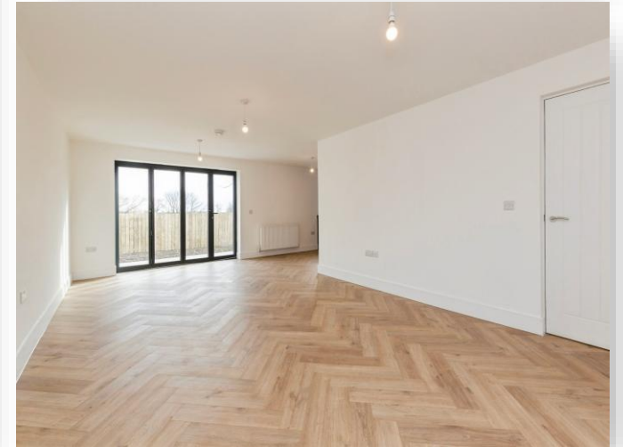
Maple Close, Thornley Durham DH6 3DW