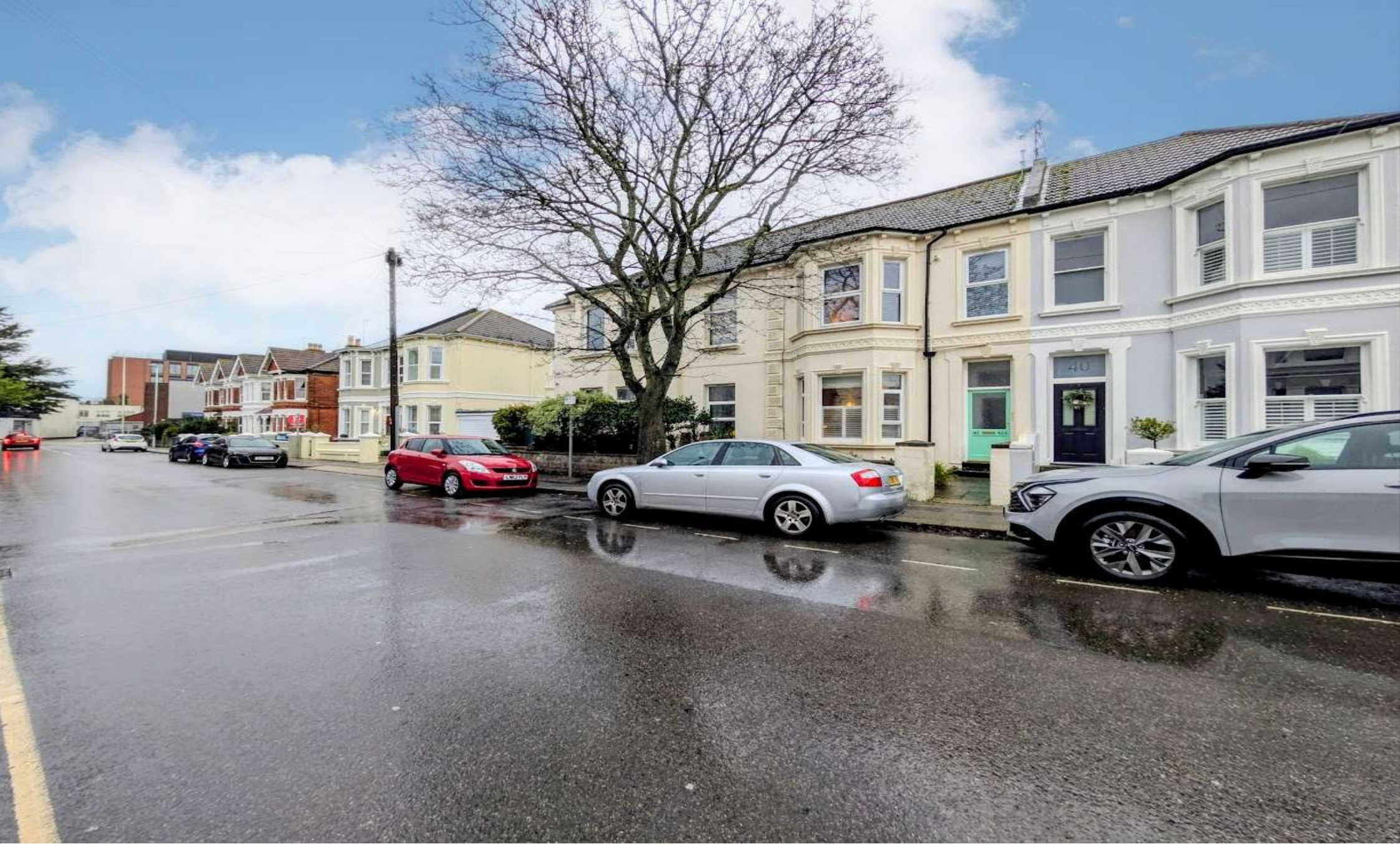
Christchurch Road, Worthing BN11 1JA