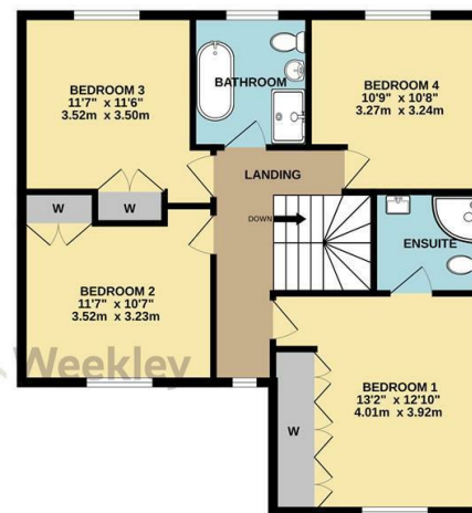
1ST FLOOR 718 sq.ft. (66.7 sq.m.) approx.