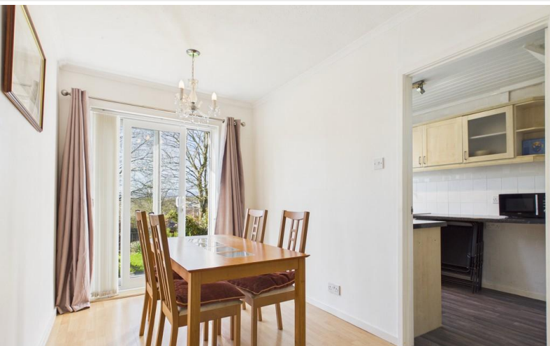
Kitchen/ Dining area