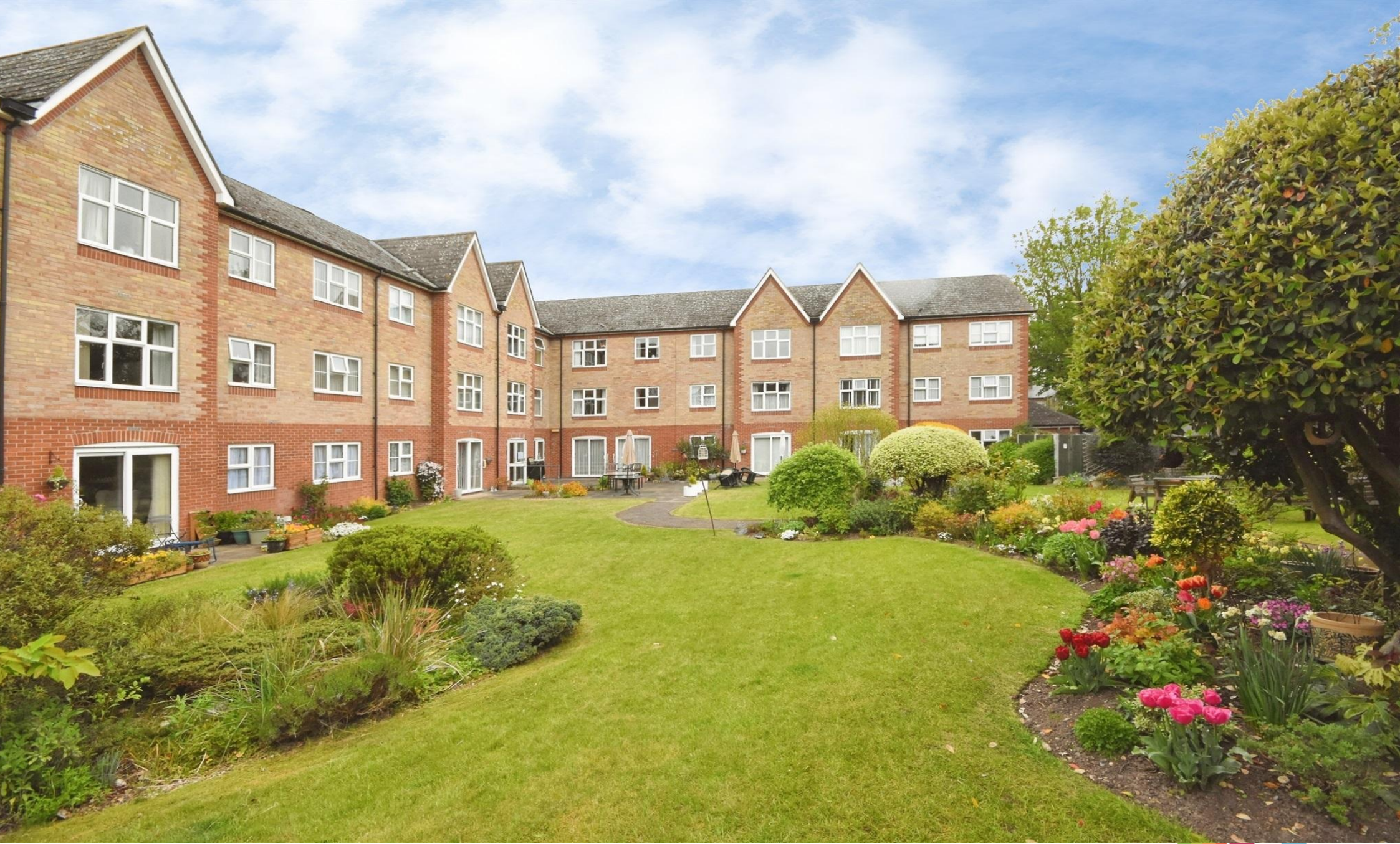
Macmillan Court, Godfreys Mews, Chelmsford CM2 0XE