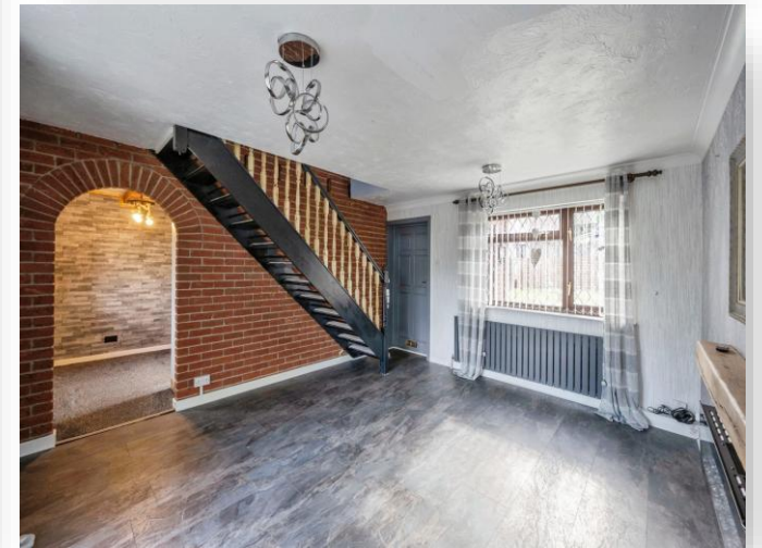
Highthorn Road, Kilnhurst Mexborough S64 5UP