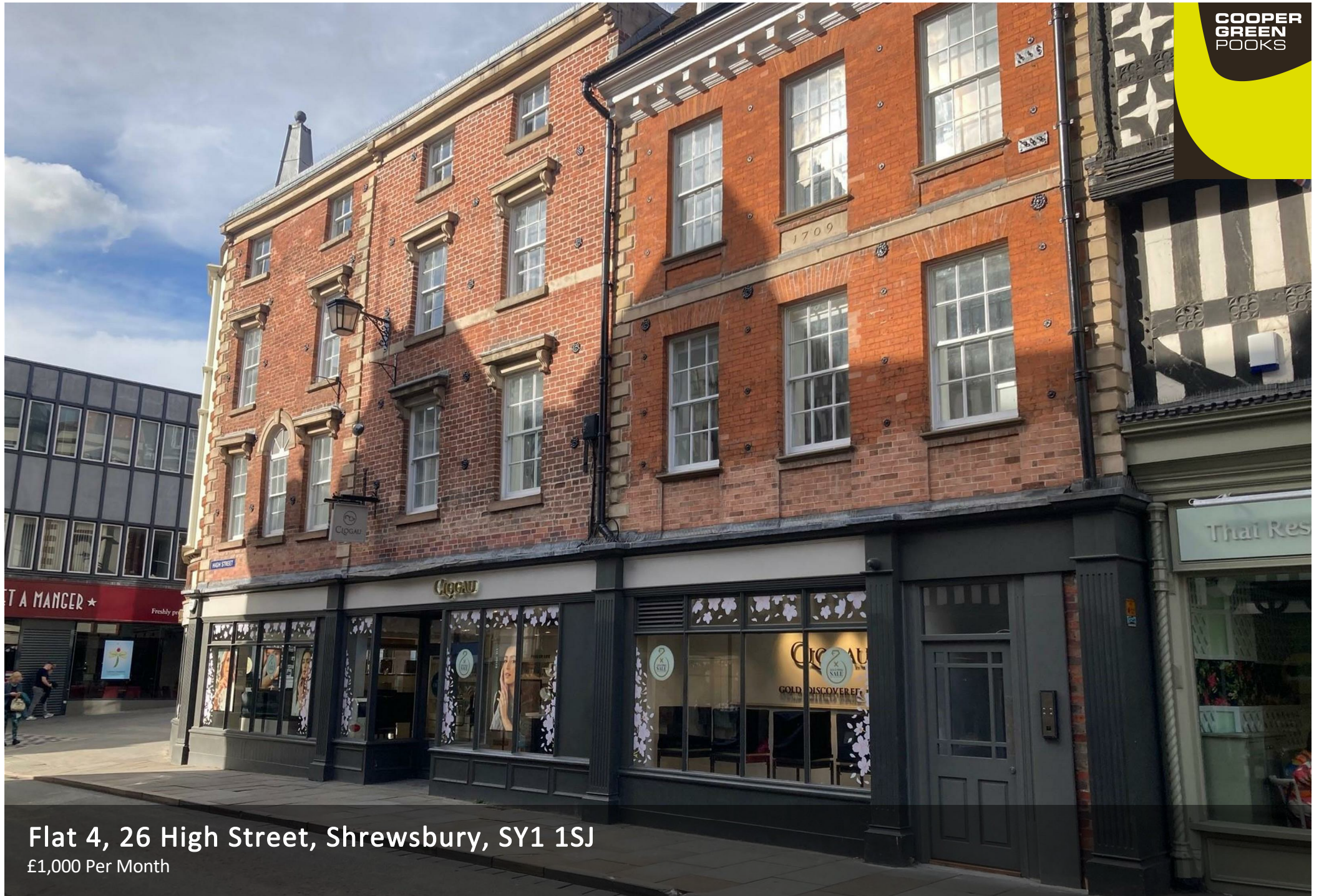
Flat 4, 26 High Street, Shrewsbury, SY1 1SJ £1,000 Per Month