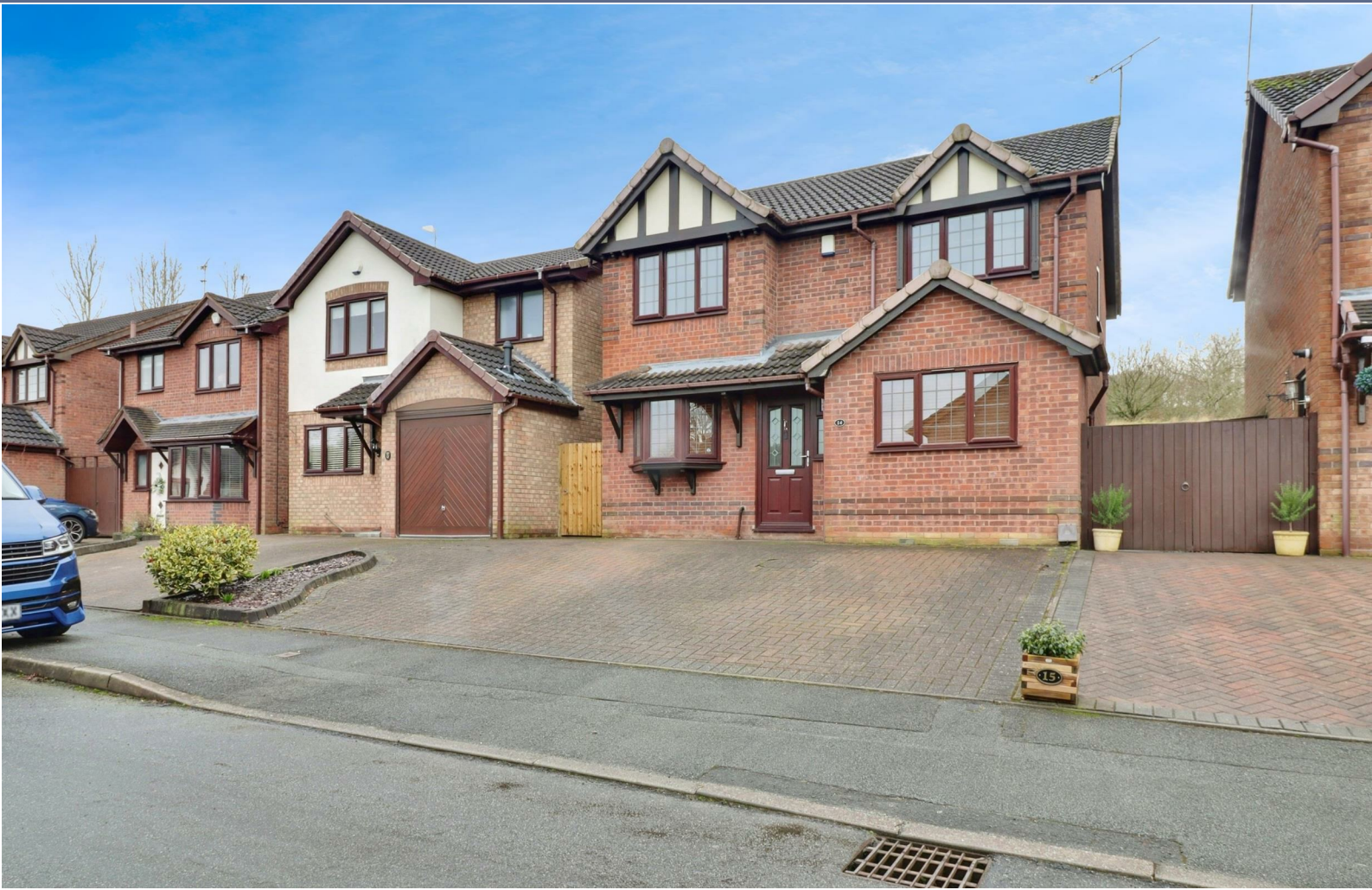
Springfield Drive Stoke On Trent