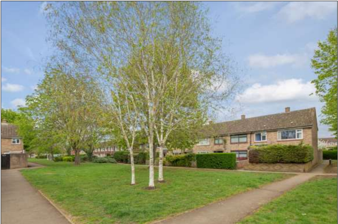
Outlook to Front