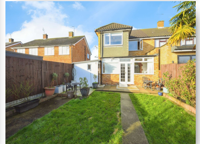
Elm Drive, Cheshunt Waltham Cross EN8 0RX