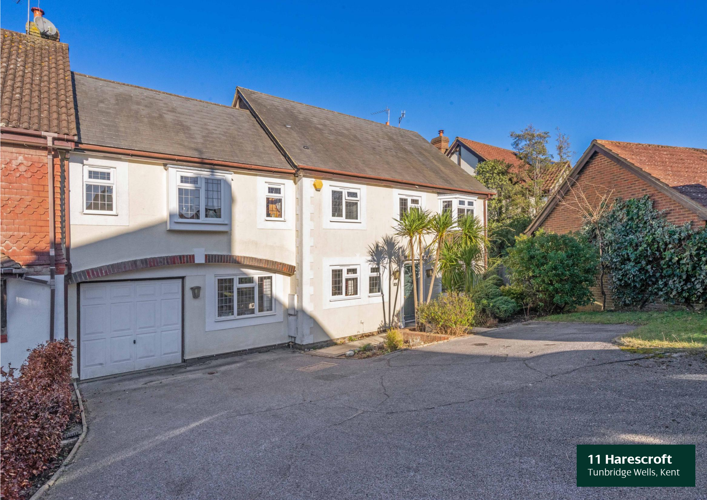
11 Harescroft Tunbridge Wells, Kent