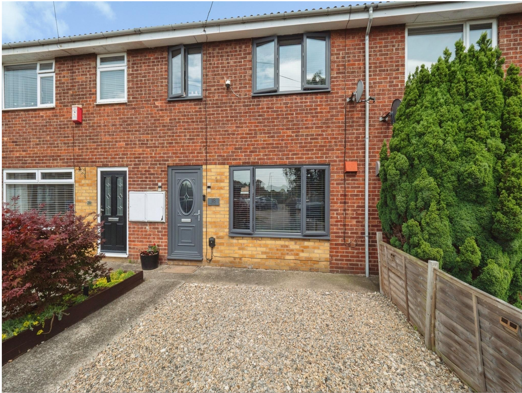
Grove Park, BEVERLEY, HU17 9JX