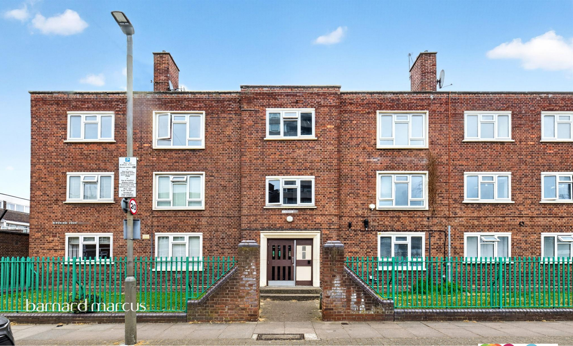
Newbridge Court Hazelhurst Road, London SW17 0UE