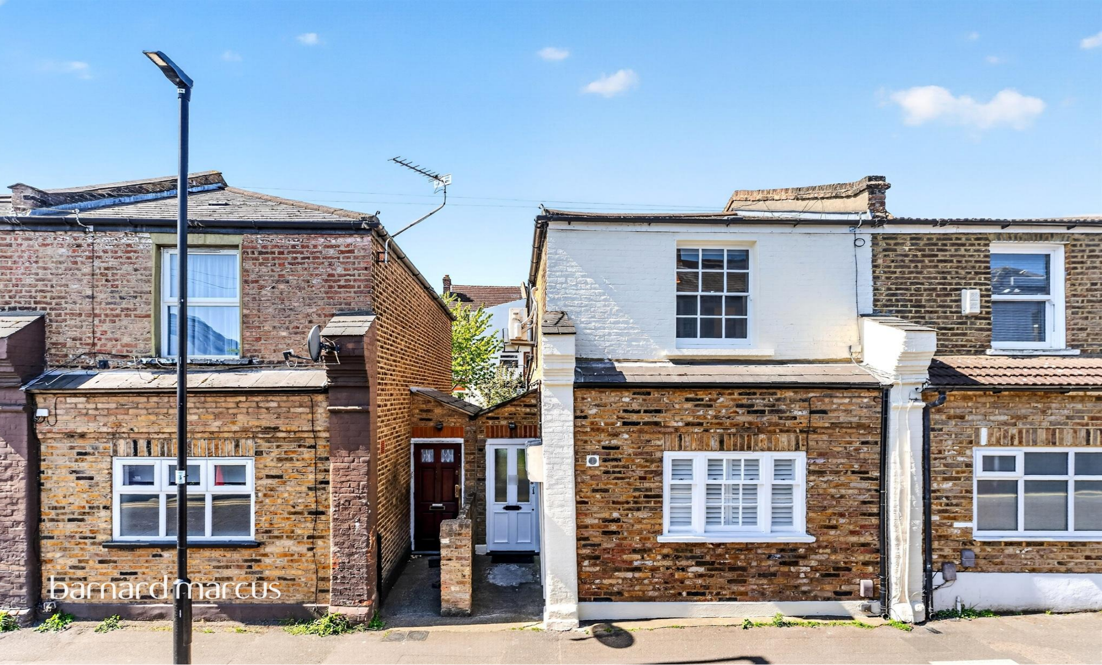
Wellfield Road, London SW16 2BP