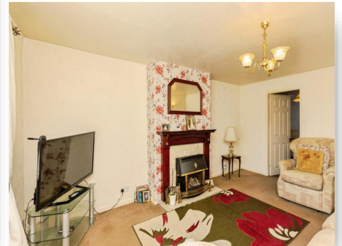
Ridgeway, Shipley BD18 1PL