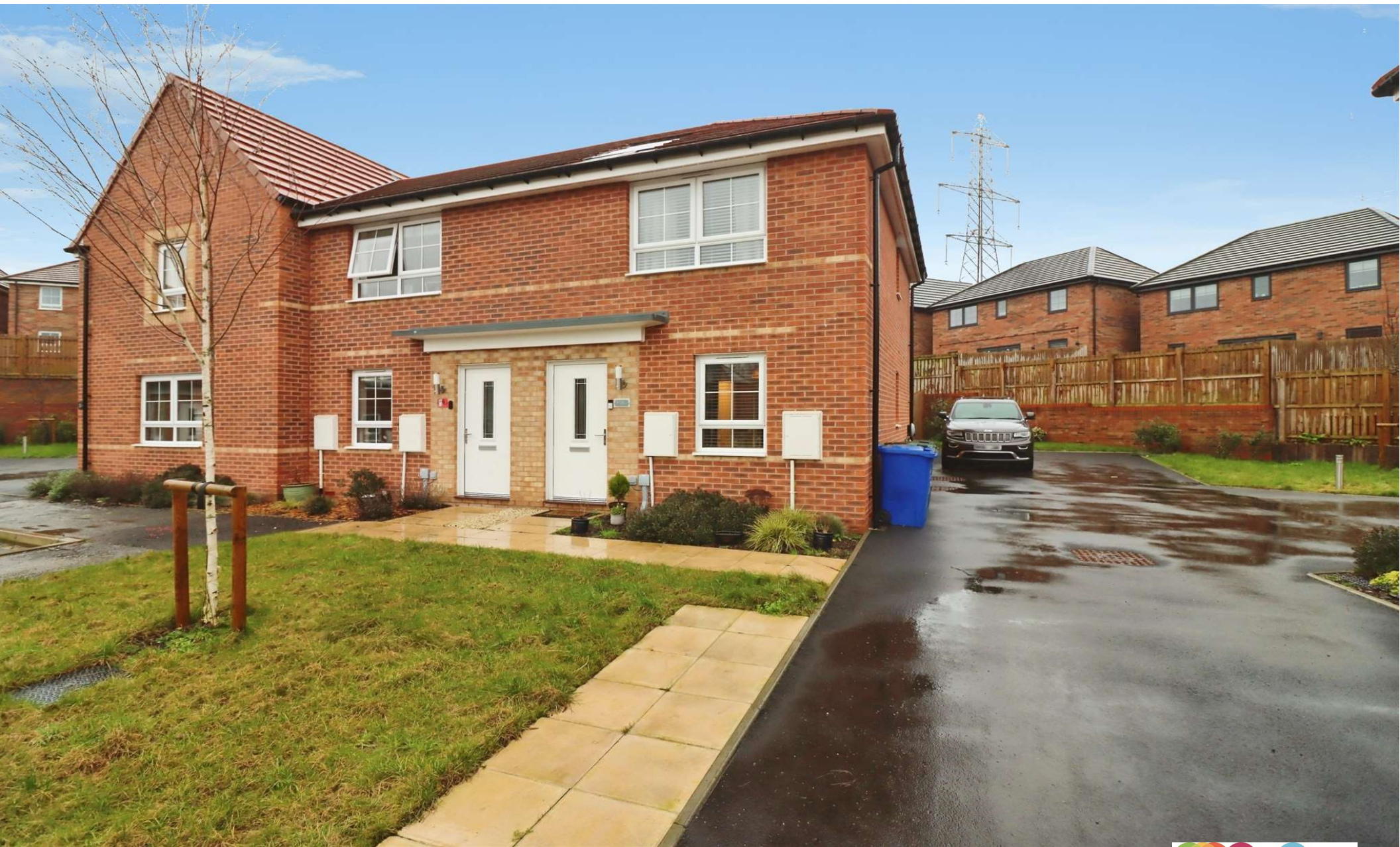
Corgi Crescent, Staveley Chesterfield S43 3GU