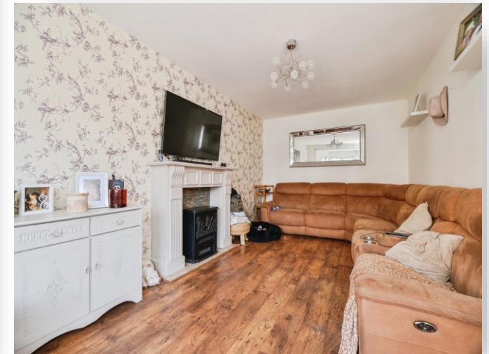
Mulberry Wynd, Stockton-On-Tees TS18 3BQ