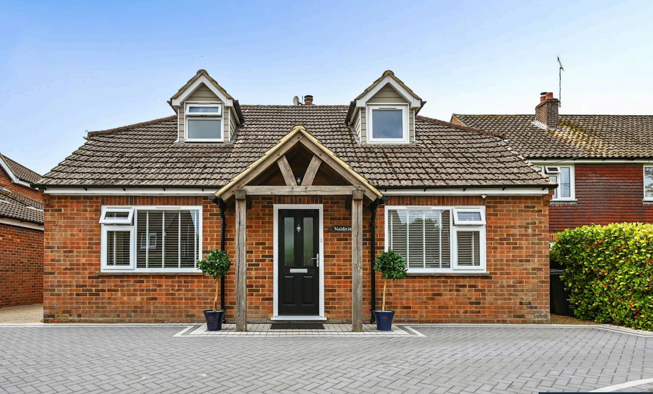
Naldicia Kingsford Street, Mersham £685,000