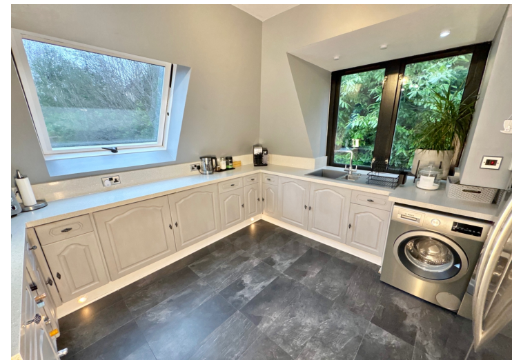
Castle Terrace, Bridge of Weir