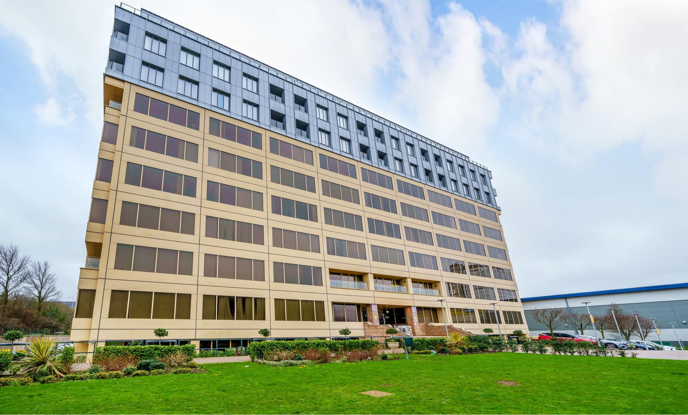
Westgate House, West Gate, London, W5 1AY