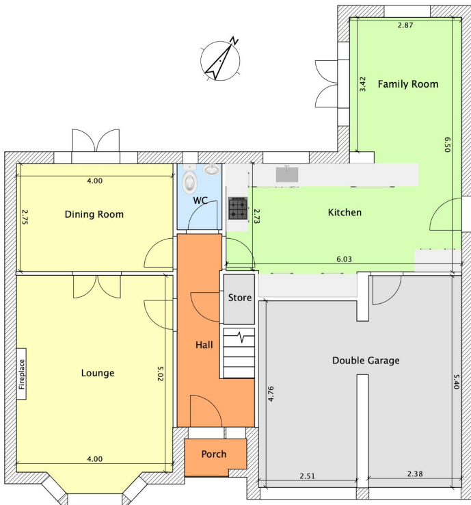
Indicative floor plans for illustration purposes only Approximate Gross Internal Floor Area 1506 ft 2 / 140 m 2 (excl Garage) GROUND FLOOR