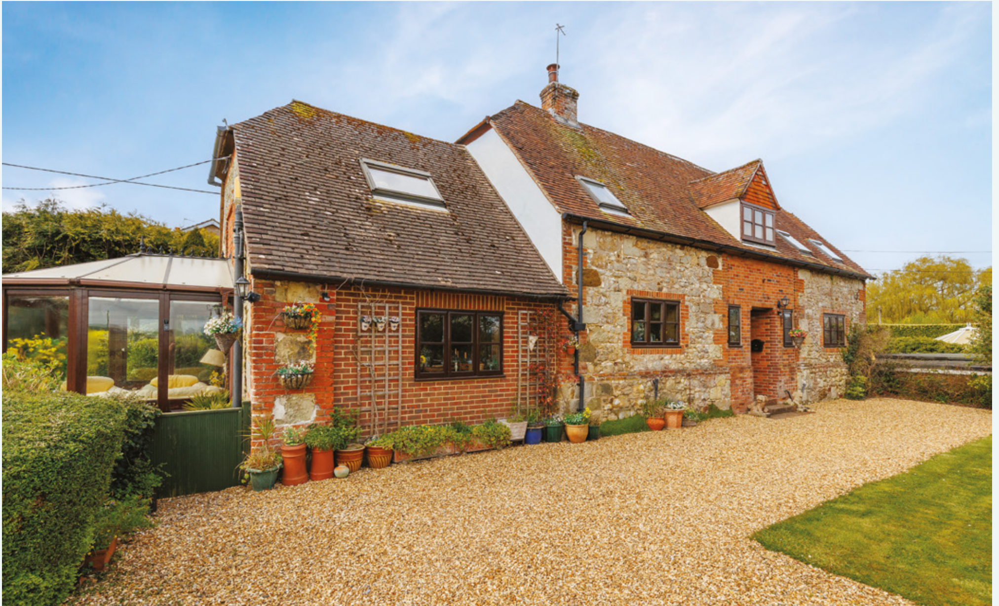
Highwood Barn, Bunkers Lane, Rookley, Isle of Wight