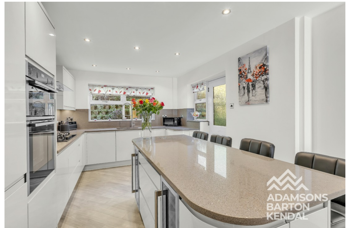
Millbrook Close, Shaw, Oldham OL2 8QA