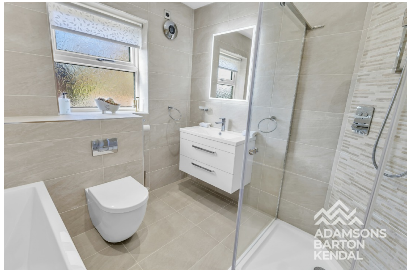
Millbrook Close, Shaw, Oldham OL2 8QA