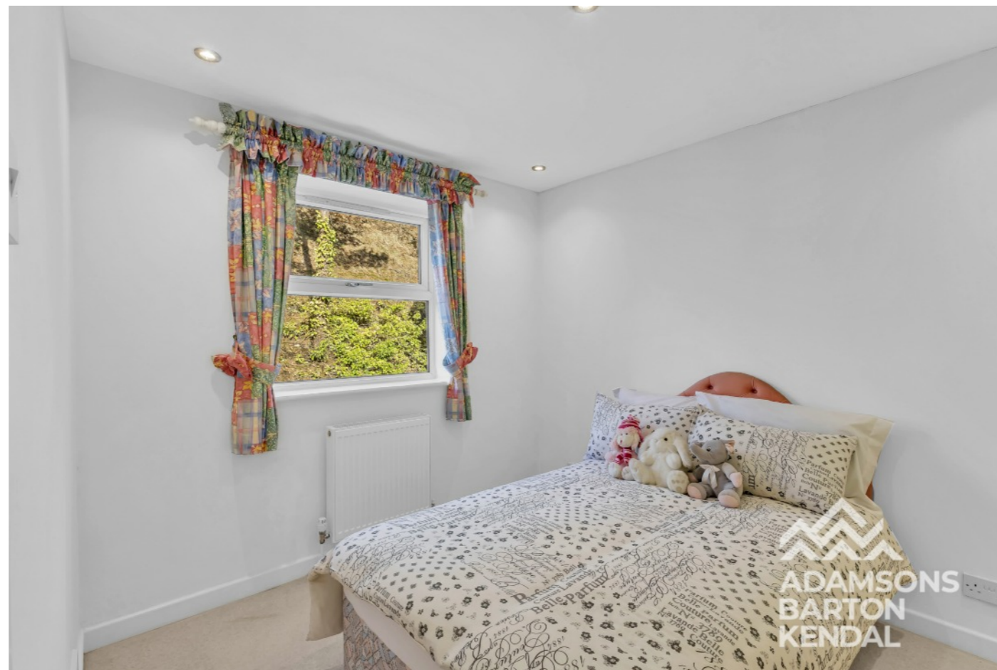
Millbrook Close, Shaw, Oldham OL2 8QA