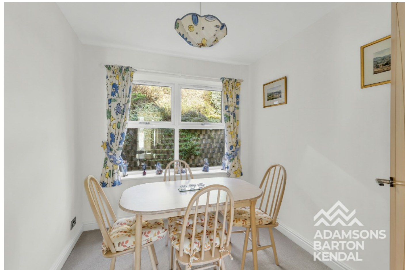
Millbrook Close, Shaw, Oldham OL2 8QA