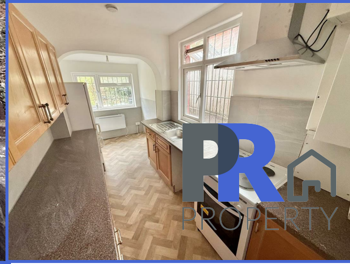
53 Farley Hill, Luton, Bedfordshire, LU1 5EG £1,600