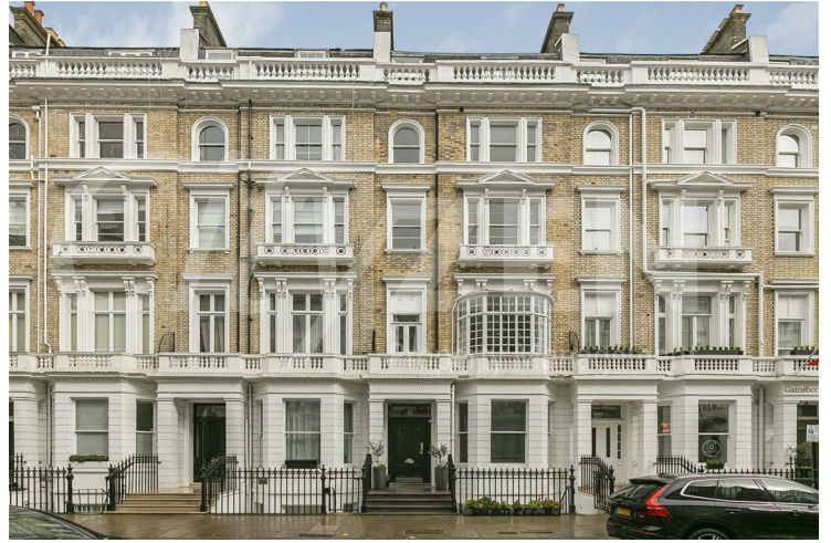
EXTERNAL OF BUILDING