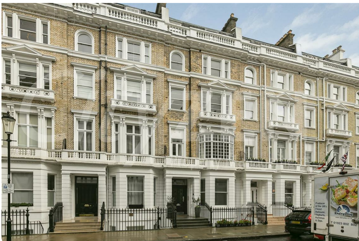
EXTERNAL OF BUILDING