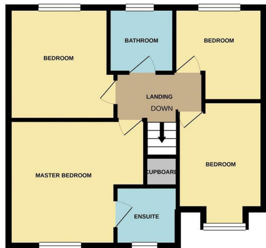
TOTAL FLOOR AREA : 1083 sq.ft. (100.6 sq.m.) approx.

Whilst every attempt has been made to ensure the accuracy of the floorplan contained here, measurements of doors, windows, rooms and any other items are approximate and no responsibility is taken for any error, omission or mis-statement. This plan is for illustrative purposes only and should be used as such by any prospective purchaser. The services, systems and appliances shown have not been tested and no guarantee as to their operability or efficiency can be given. Made with Metropix ©2021