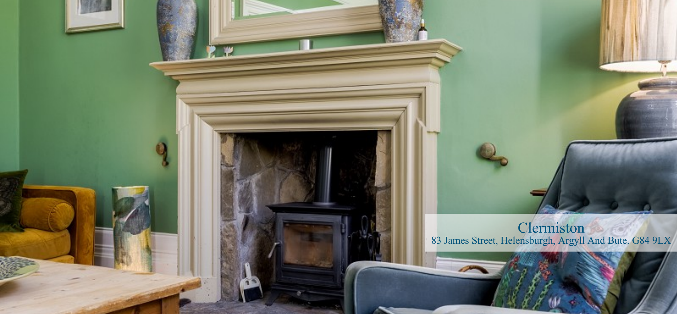
Clermiston 83 James Street, Helensburgh, Argyll And Bute. G84 9LX