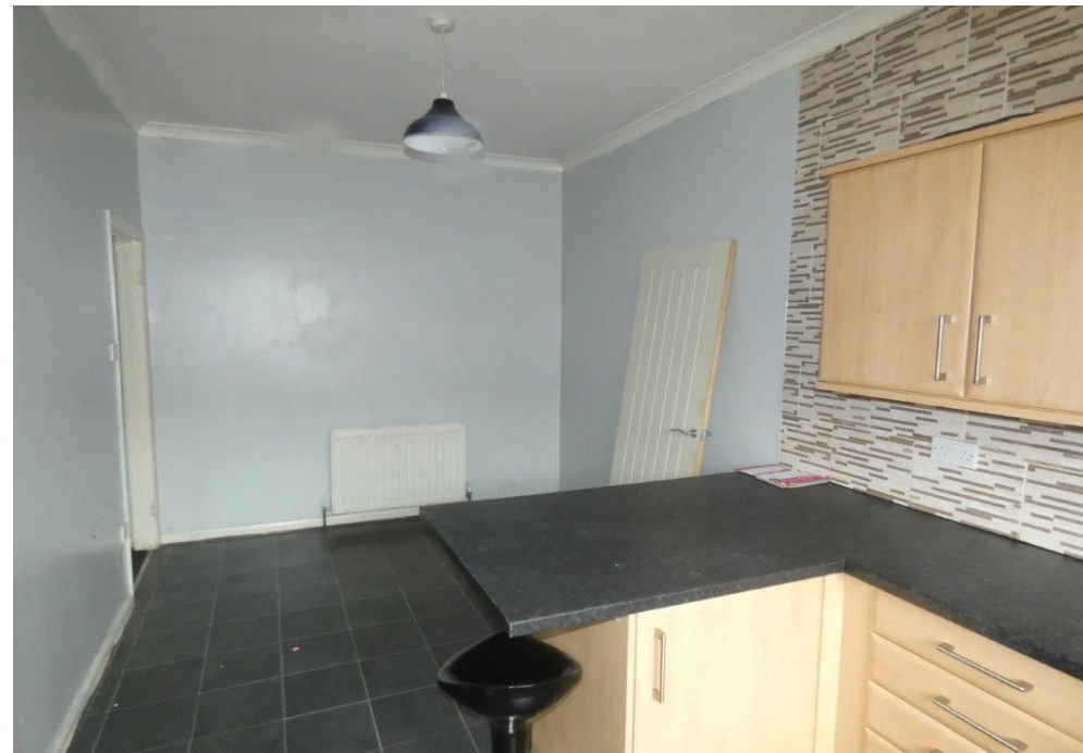
EPC Rating - C

47 Ridley Street, Cramlington NE23 6RH Available with no upper chain this three bedroomed mid terraced house offers an excellent opportunity for investors/developers or those looking to buy a spacious house to refurbish to their own taste. The property is conveniently situated for access to local amenities together with public transport and road links to nearby centres. The accommodation briefly comprises a lounge to the front, dining kitchen to the rear, rear porch, three first floor bedrooms and shower room/w.c. Externally there is a yard to the rear and the property benefits from gas fired central heating together with upvc double glazing.