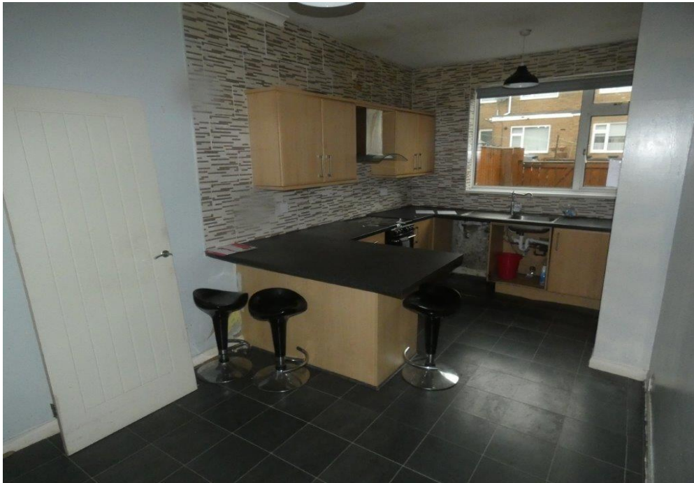
Mid Terraced House