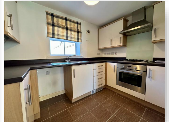
Verde Close, Eye Peterborough PE6 7GR