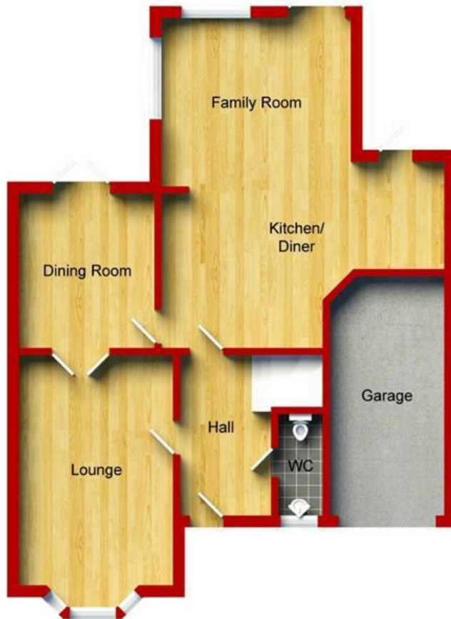
Ground Floor Approximate Floor Area (80.30 sq.m)