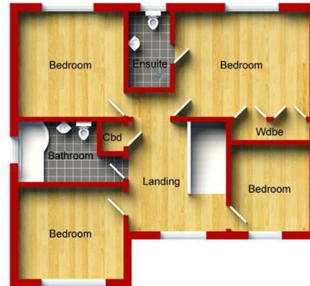
First Floor Approximate Floor Area (64.20 sq.m)