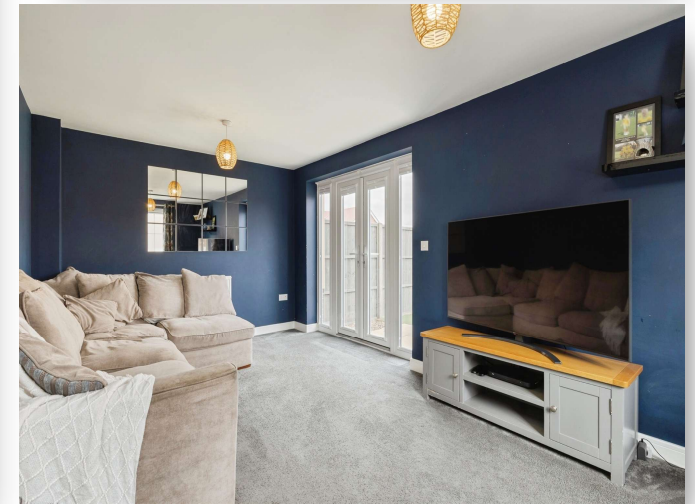
Tortoishell Drive, Attleborough NR17 1GW